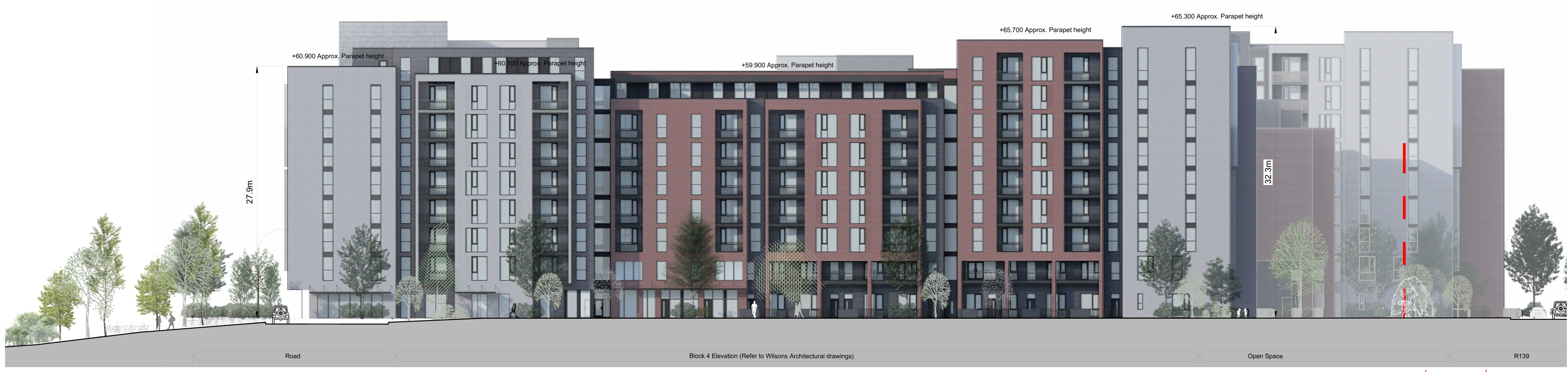
SECTION O-O Continued 4/4