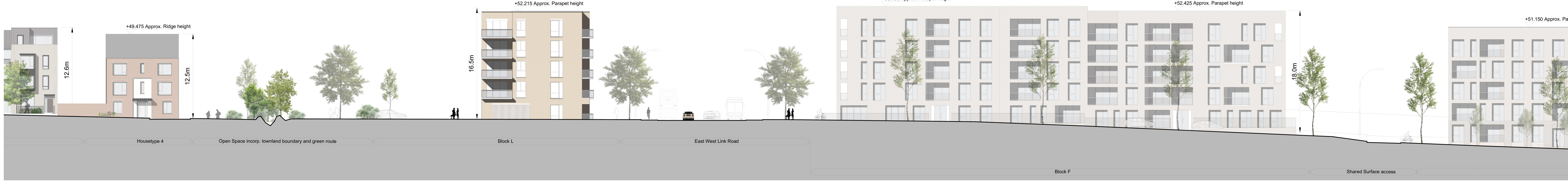
SECTION O-O Continued 2/4