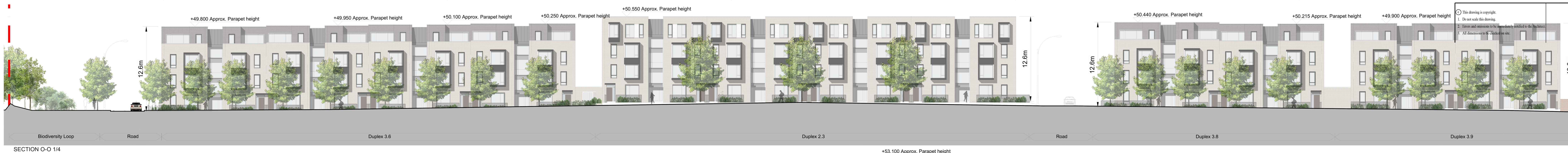
SECTION O-O 1/4